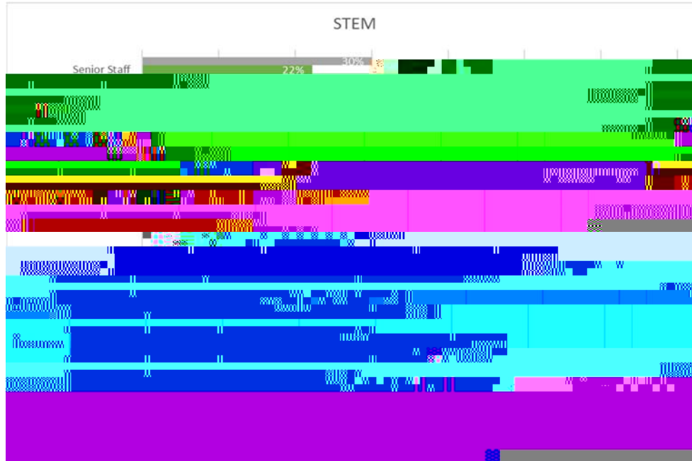
Chart 7: STEM female staff as a proportion of role Male / Female within roles 2014/15 – 2016/17

Y [ { ^ } / æ ! ^ Á ! ^ } ! ^ • ^ } c ^ á á } Á • | ä * @ c | ^ Á * ! ^ æ c ^ ! Á ] ! [ ] [ : c ä [ ] • Á ä } ACEPÙÜÓŠÁc@æ } Á Û V Ò T É Á Á } Á à [ c @ Á C E P Ù Ü Ó Š Á æ } á Á Û V Ò T É Á ! ^ } ! ^ • ^ } c æ c ä [ ] Á á ! [ ] • Á [ ~ Á æ ä [ ç ^ Á Senior Lecturer Š ^ ç ^ | É Á V @ á • Á @ á * @ | ä * @ c • Á c @ ^ Á } ^ á á c [ Á & [ ] c ä } ~ ^ Á ^ ç á • c ä } * Á , [ ! \ Á ~ } á ^ ! , æ ^ Á c [ Á á { ] ! [ ç ^ Á c @ ^ Á ] ! [ * ! ^ • • ä [ ] Á [ - Á , [ { ^ } Á - ! [ { Á { [ ! ^ Á ~ } á [ ! Á c [ Á • ^ } á [ ! Á ] [ • c • Á æ & ! [ • • Á æ | | É á • & á ] | ä } ^ • É Á Á Y ^ Á , ä | | Á ^ ç c ^ } á Á , [ ! \ Á & ~ ! ! ^ } c | ^ Á á á } * Á ~ } á ^ ! c æ \ ^ } Á ä } Á Ó C E Š Á c [ Á ~ } á ^ ! • c æ } á Á c @ ^ Á ! ^ } * c @ Á [ - Á c ä { ^ Á c æ \ ^ } Á - [ ! Á & ~ ! ! ^ } c Á Readers æ } á Á Professors c [ Á ! ^ æ & @ Á c @ ^ á ! Á ] [ • ä c ä [ ] • Á æ } á Á á } ç ^ Á c ä * æ c ^ Á , @ ^ c @ ^ Á c @ ^ Á ! ^ Á æ ! ^ Á * ^ } á ^ ! ^ á Á ] æ c c ! } • É Á Y ^ Á , ä | | Á ~ ! c @ ^ Á & [ ] • á á ^ Á c @ ^ Á b [ ~ ! } ^ Á [ - Á Senior Lecturer á } c [ Á c @ ^ Á } ^ , á Associate Professor ! [ ! ^ • É Á Á